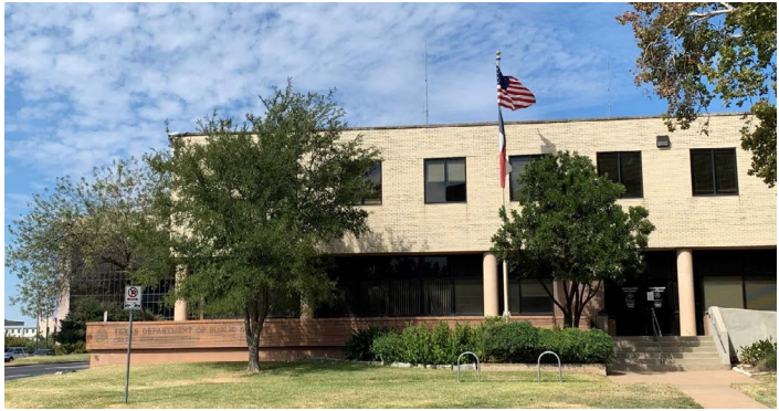
American Legion State Headquarters

City Block 46 (1500 Congress) – For the last month, this site was being used as a staging site for construction materials. On the rainy afternoon of Tuesday, April 25, 2023, the flags at the building flew for the last time. In a brief and somber ceremony DPS troopers lowered the flags and closed the last chapter of the American Legion building's history. Demolition of the building began shortly afterwards.