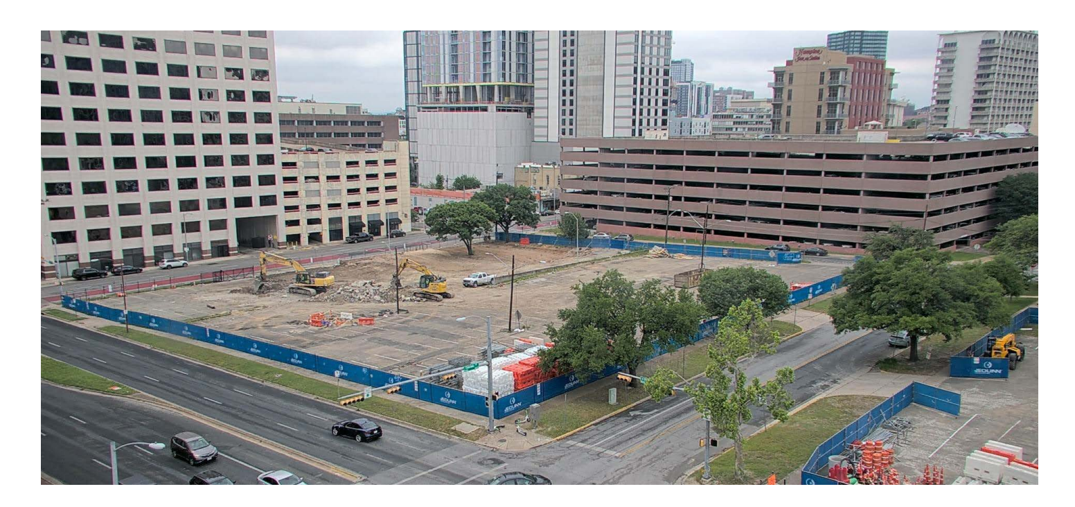
City Block 39 (1501 Lavaca) – Demolition of the old buildings is complete. Demolition crews are continuing to extract the asphalt and pavement from the site.

During the demolition of these sites, all sidewalks and Colorado Street will remain open.